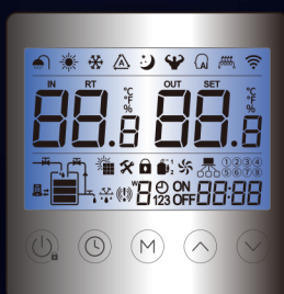
3 Intelligent Mode